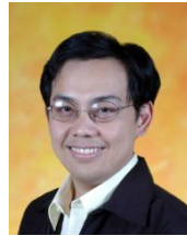
IL12 Nipon Theera-Umpon (Chiang Mai Univ. ,hailand) Boundary Detection Using Edge Following Algorithm Based on Intensity and Texture Gradient Features