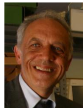
IL8 Danilo De Rossi (Univ. of Pisa, Italy) A Wearable Platform for Remotely Assessing and Monitoring Inner Mental States and Affective Disorders