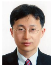
IL10 Dae-Hyeong Kim (Seoul National Univ., Korea) Flexible and Stretchable Electronics and Applications for Biomedical Devices